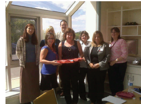
The Cambridge Pizza Party

Congratulations to everyone involved – we hope you enjoyed your lunch!