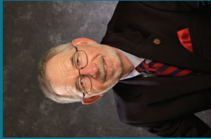
From the Editor's Desk